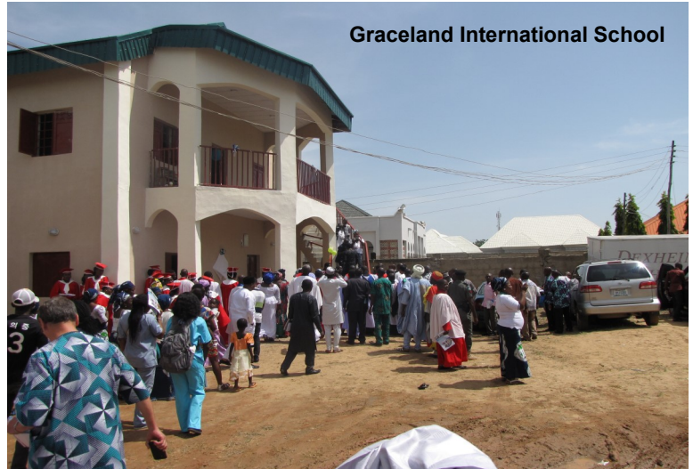
Graceland International School

Graceland Hospital is located adjacent to Graceland International School, a K–12 school also run by the Anglican Diocese of Gusau. We hope to integrate the learning environment of the school and the healing environment of the hospital. Many of the students from the school aspire to be doctors, nurses, lab scientists and pharmacists. We intend to provide practical “on the job” opportunities for the students at the new hospital. Our hope and dream is to open a School of Nursing on this campus in the future.