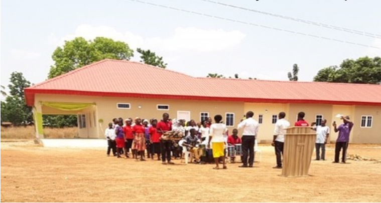
Arthur and Esther Bradley Memorial Hospital

In October, we dedicated our fourth medical facility - Graceland Hospital in Gusau . Graceland Hospital is our largest facility to date. This larger building was made possible by the heroic efforts of fundraising by the Anglican Diocese of Gusau, a very generous donor from Ohio and Kateri Medical Services.