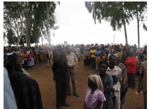
Morning crowds...each day.

The foundation is laid. It has taken time, as the blocks had to be brought in from another area to ensure quality.