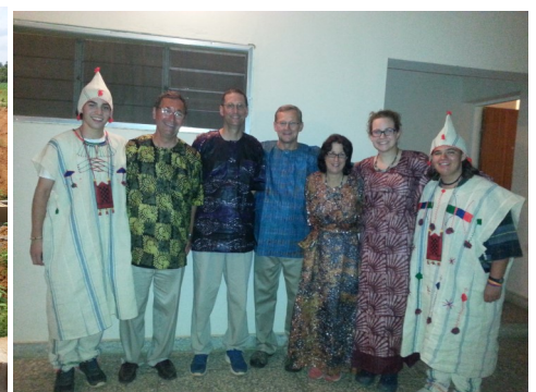
Authentic Nigerian outfits, courtesy of out hosts! The young men wear traditional Fulani cattle herder dress.