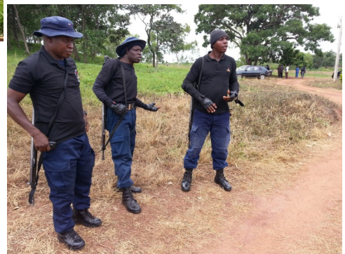
Counter-terrorism task force troops